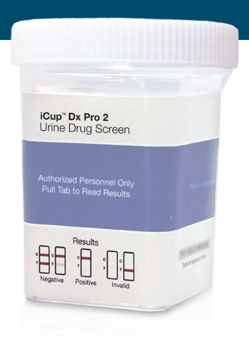
For professional in vitro diagnostic use