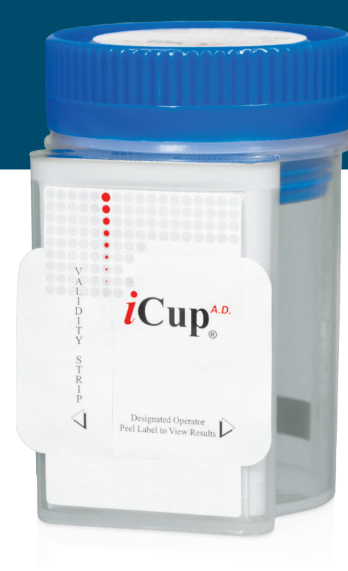
For professional in vitro diagnostic use.