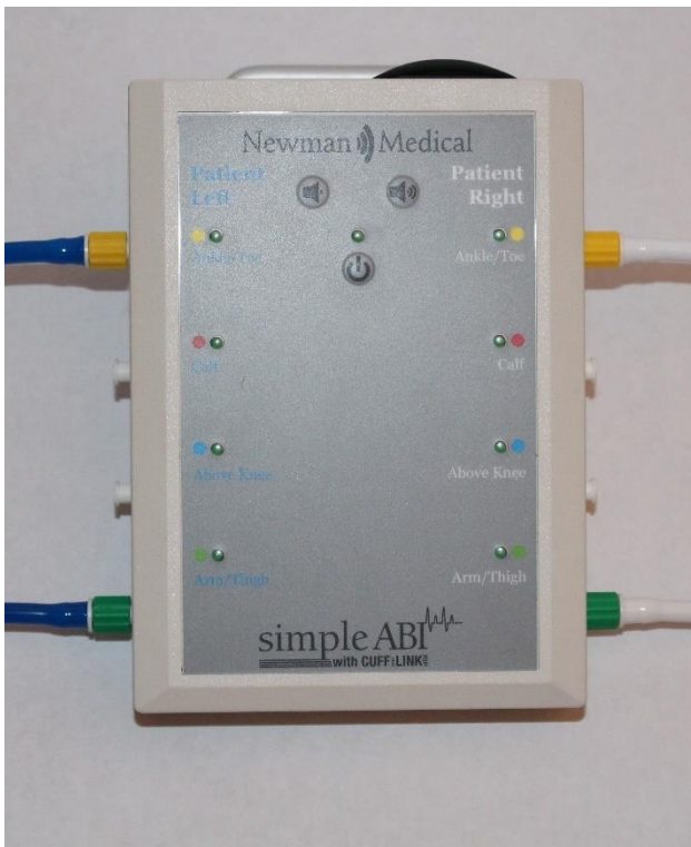
Cuff-Link Control Unit with tubing properly attached