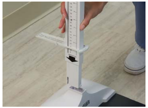
Insert Column Piece marked "B-C" into Column Piece "A-B" and press down to lock in place.

<sup>(6)</sup> Install (1) Stabilizer on Column Piece "A" (with large arrow) and insert into Base as shown below.