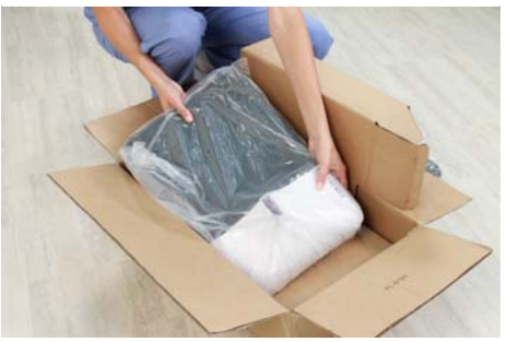
Verify carton contents: Base, Headpiece, (4) Column Pieces and (2) stabilizers.

<sup>(2)</sup> Lift insert to side to fully expose Base and using both hands remove Base from carton.